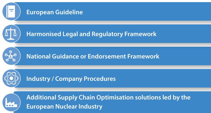
Figure 4 – Proposed flow of the FORATOM recommendations

To support a wider application of this direction within Europe, FORATOM proposes a number of recommendations which flows from the initiative of producing a European guideline.