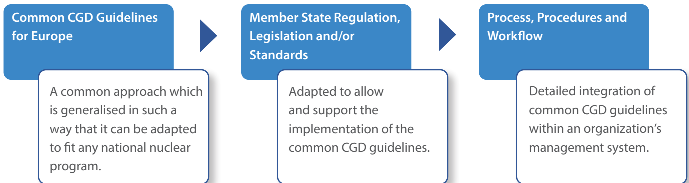
Figure 3 – How a new European guideline could be implemented at the national level to support the safety and sustainability of nuclear power plants.

and workflows for implementing the new guideline and local specificities into their management systems (see Figure 3 – How a new European guideline could be implemented at the national level to support the safety and sustainability of nuclear power plants).