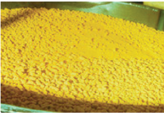
Uranium ore concentrate