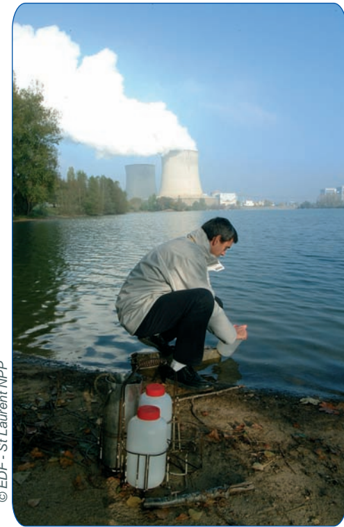
© EDF - St Laurent NPP

When you consider the full industrial cycle from the construction of a nuclear power plant, through its operational duration, to its decommissioning, nuclear energy has one of the lowest impacts on the environment of any energy source because it emits virtually no air or water-borne pollutants and isolates