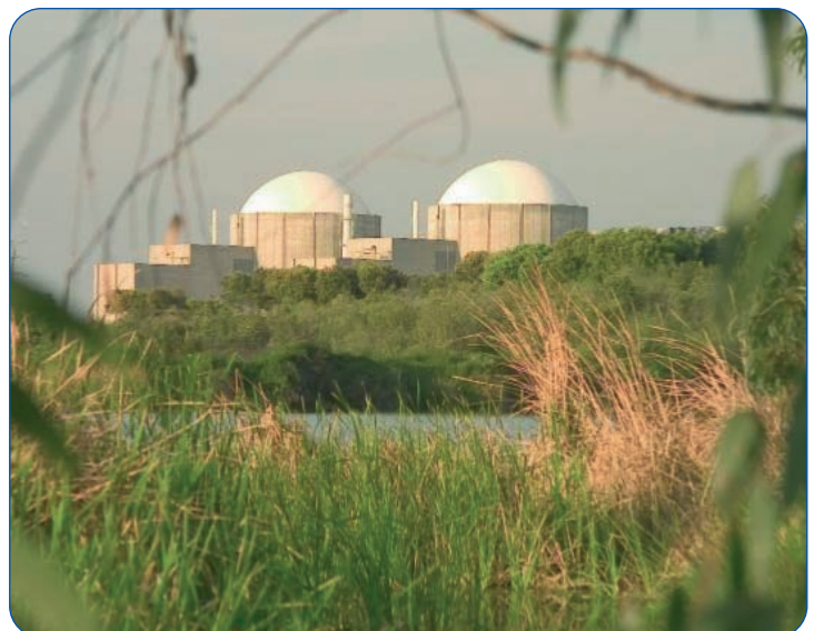
Almaraz NPP, Spain

The nuclear industry is constantly applying the latest technological innovations to optimise its environmental and operational performance. This will help it reduce still further its carbon footprint applying the latest technological innovations.