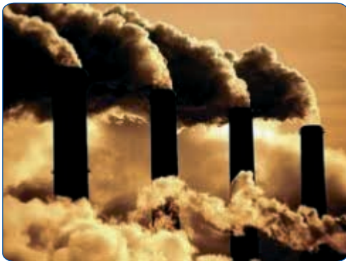
A fossil fuel power plant

Reducing the CO 2 emissions that cause climate change is one of the great social, economic and environmental challenges of our time. Promoting a global low-carbon economy is a major priority. The nuclear industry, unlike its fossil fuel counterparts, emits virtually no greenhouse gases (GHG). But nuclear's environmental credentials go further than that.